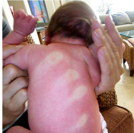
(b) 2 weeks—Father's Hand Print