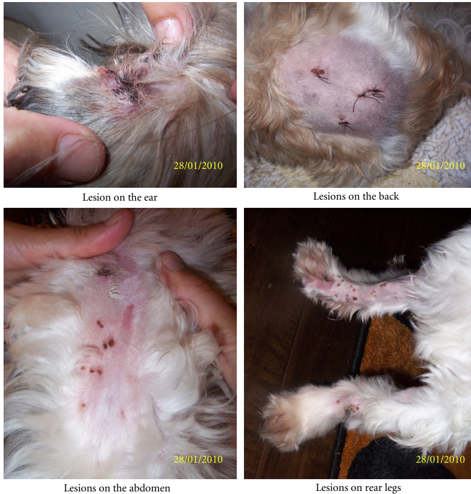
FIGURE 2: This figure demonstrates the sites of the subcutaneous and lipoma tumors that were removed from the pet dog. The Veterinarian stated that the presence of 72 such lesions on an animal is a very rare observation.

Services [26] and Engineering Dynamics Corp [27]. The results of the two inspections are briefly summarized.