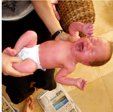
(a) Newborn—Total Body Flare